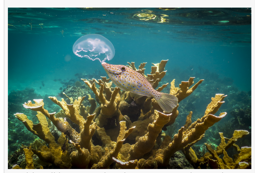
Healthy Elkhorn Coral and a Trumpet Fish in Cuba's Isle of Youth

Book Cover: "The Remarkable Reefs of Cuba: Hopeful Stories from the Ocean Doctor"